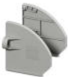
Flange cover, Color: gray